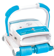
Monte Carlo' XL Floor and walls