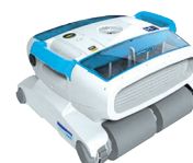
Monaco 100 Floor