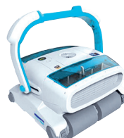
Monaco 200 Floor and walls